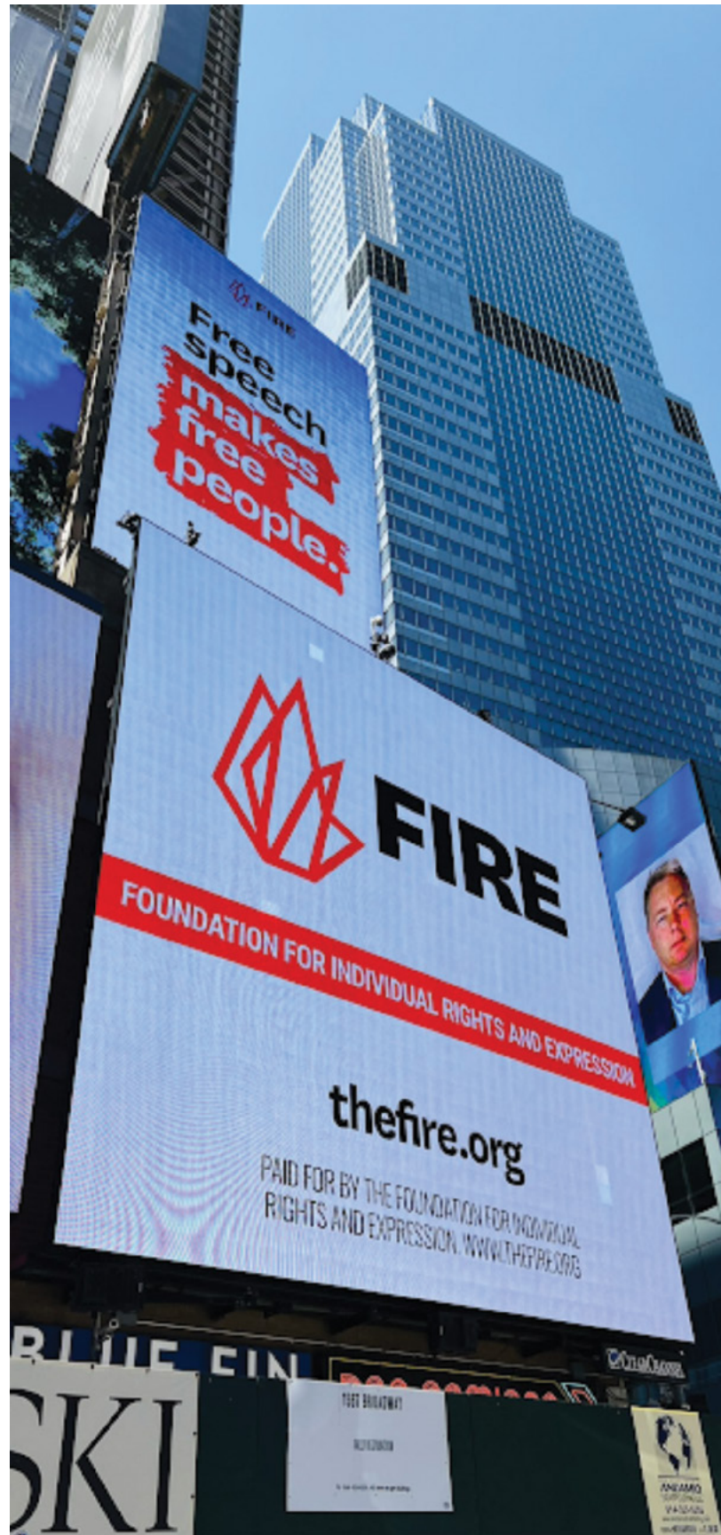
FIRE BILLBOARDS IN TIMES SQUARE

With that success in mind, we are taking the show on the road and setting up summer campaigns in Chicago and Nashville, two cities that we think have audiences who will be very receptive to our message.